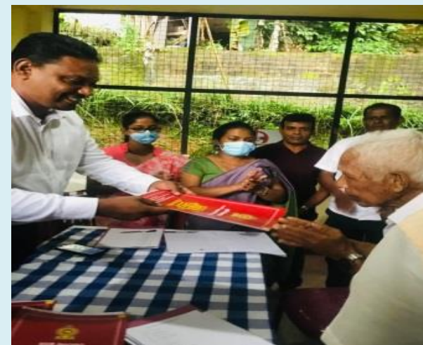
Grant deeds to low income community