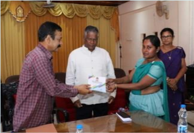
Introducing of Tax Guidelines code