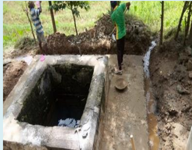
Water source Conservation Projects